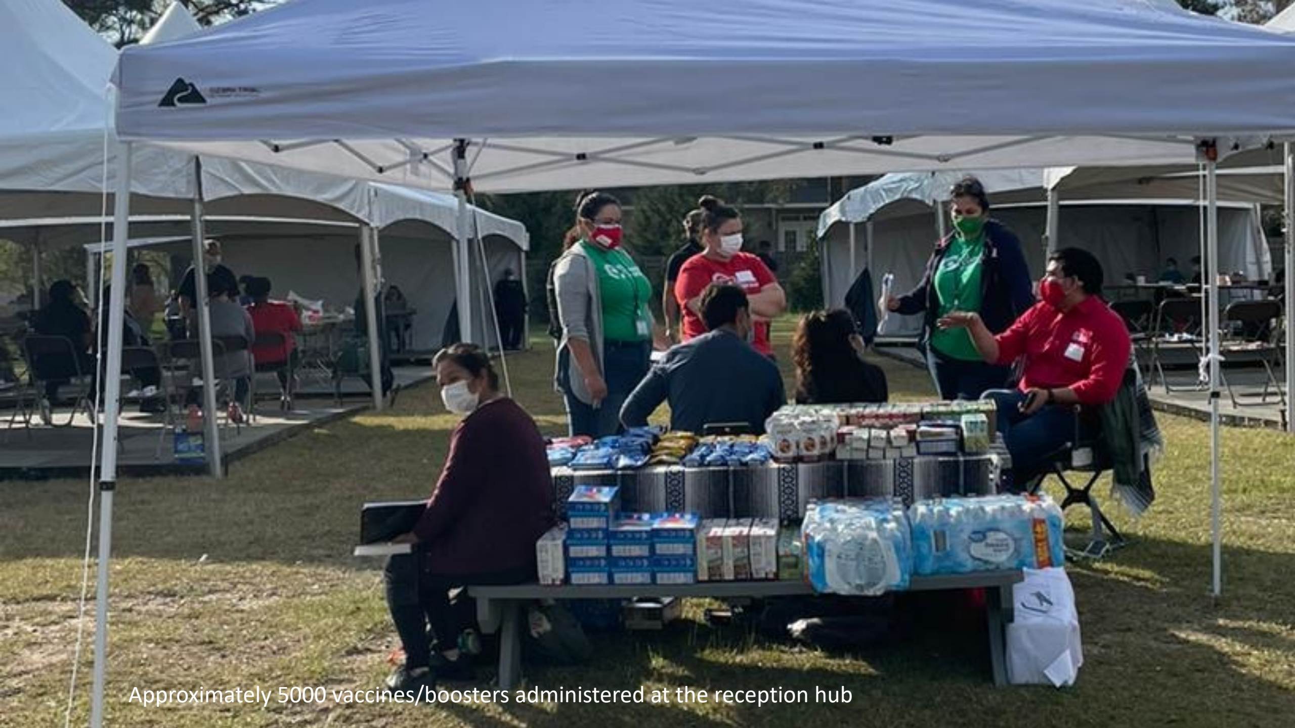
Approximately 5000 vaccines/boosters administered at the reception hub